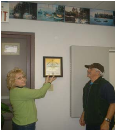
SeaScout Charter Finds a Home