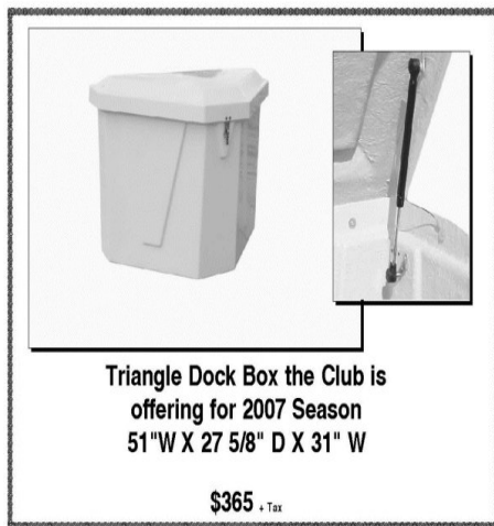
Triangle Dock Box the Club is offering for 2007 Season 51"W X 27 5/8" D X 31" W