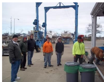
Spring clean-up: let's get ready

I hope everyone's year is off to a great start. With weeks away from 2017 boating season, progress continues around the club with many great and some unexpected changes ahead of us. First, we have implemented a social membership for those who don't have a boat but would like to join in all the fun and events at the club. A Social membership is $40 per person or $60 per couple, we have many great events planned for this year and hope this helps make the events even better. Next, we are going to be helping in the Black River Clean up May 6 th and 7 th and we'll be a launch and dumpster site during the cleanup and we'll be hosting the lunch for the volunteers on Sunday. We are looking for people to volunteer to help in the cleanup so if you're interested please contact myself or the Vice Commodore for more information. (This article was reprinted from previous issue)