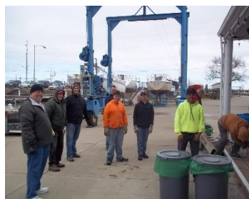
Spring clean-up: let's get ready

I hope everyone's year is off to a great start. With weeks away from 2017 boating season, progress continues around the club with many great and some unexpected changes ahead of us. First, we have implemented a social membership for those who don't have a boat but would like to join in all the fun and events at the club. A Social membership is $40 per person or $60 per couple, we have many great events planned for this year and hope this helps make the events even better. Next, we are going to be helping in the Black River Clean up May 6 th and 7 th and we'll be a launch and dumpster site during the cleanup and we'll be hosting the lunch for the volunteers on Sunday. We are looking for people to volunteer to help in the cleanup so if you're interested please contact myself or the Vice Commodore for more information. (This article was reprinted from previous issue)