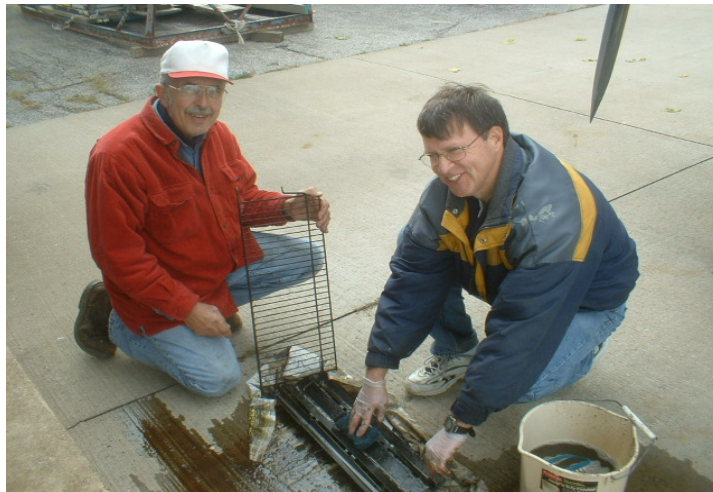
OOh heck...let's do it by hand