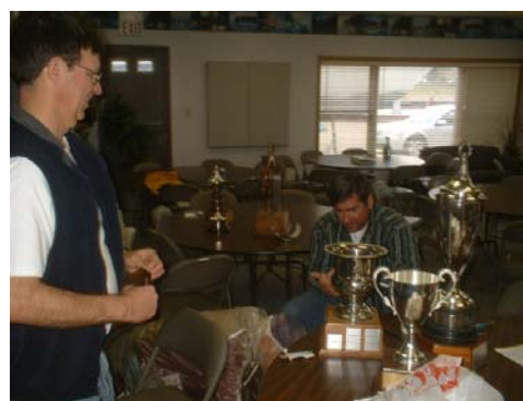
Getting Ready for the Change of Watch