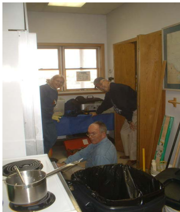
They are new and wise; they stayed in and close to the food