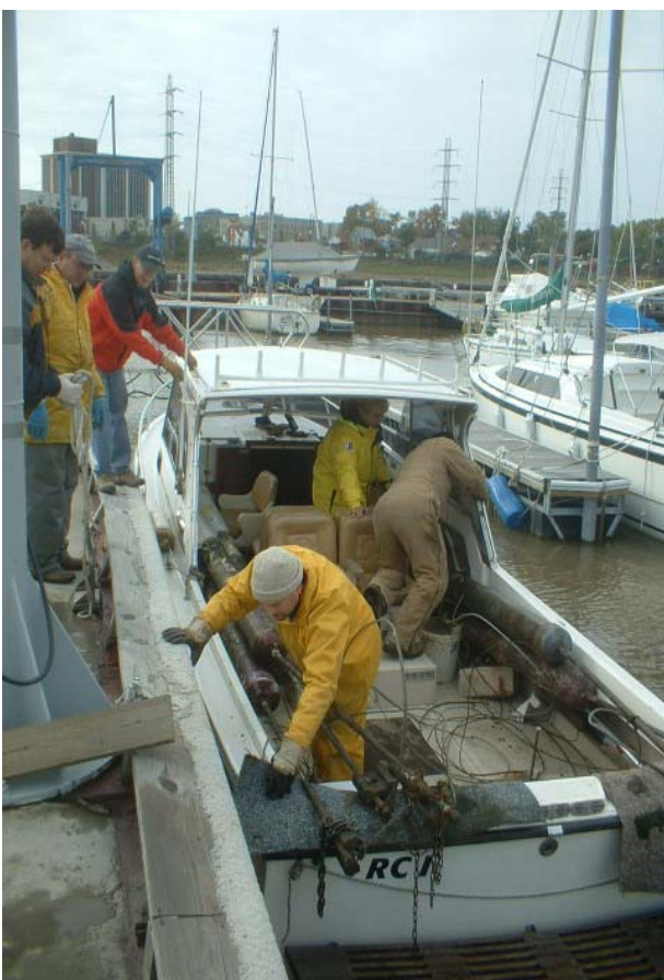
Marks are out; the season is over!