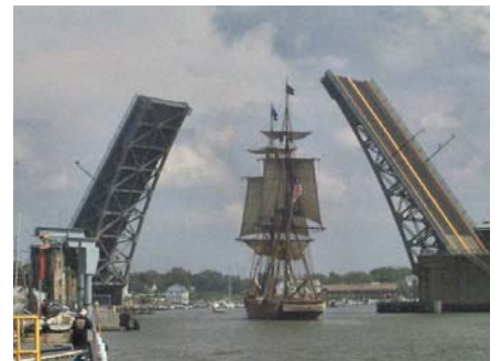
PRIDE OF BALTIMORE II ARRIVES IN LORAIN HARBOR.....