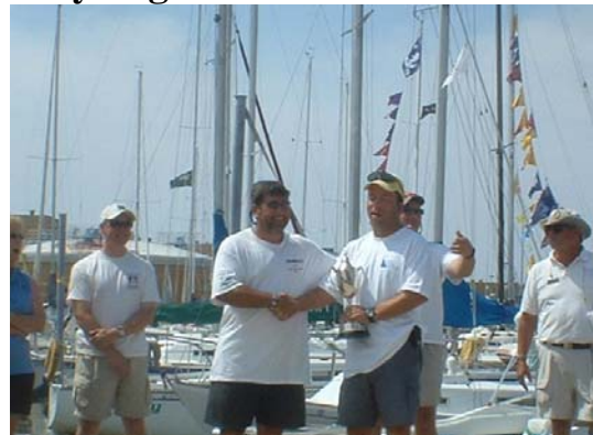
And the SPITZER CUP goes to.....