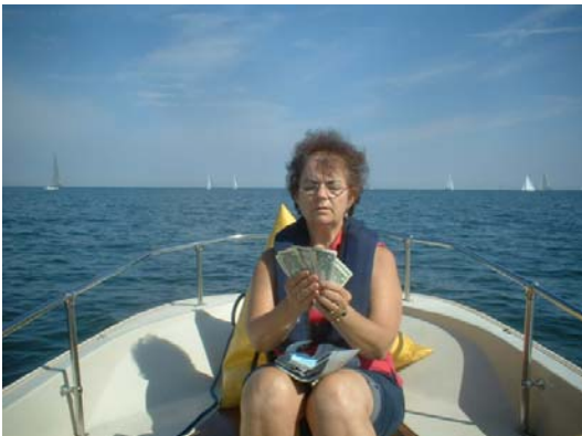
Tabulating the race results?! (just getting the dinner count!)