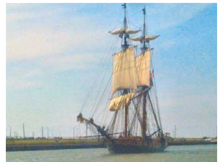
Sponsored by the Lorain Port Authority