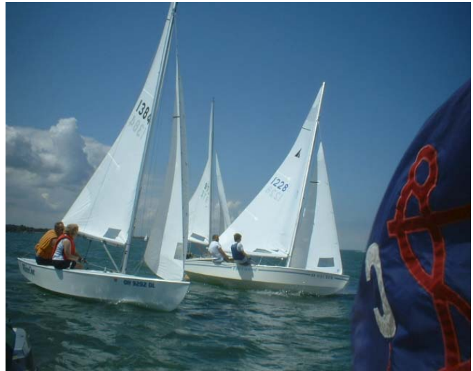
An Interlake Race