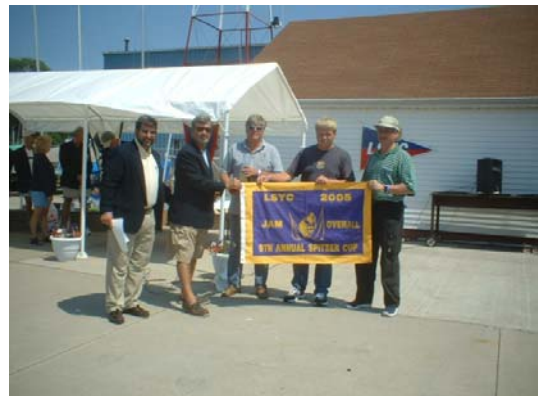
Sptizer Regatta ; after sailing- the awards and celebration.