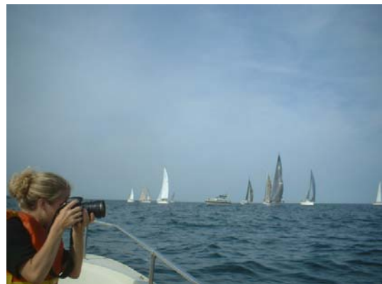
At times it was picture perfect