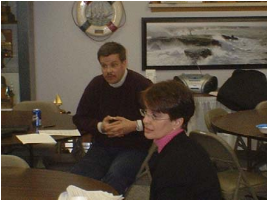
It all starts with planning – A board Meeting moment