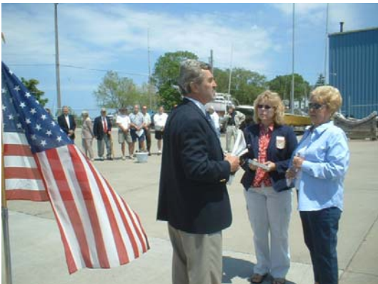
Memorial Day celebration