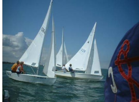
Summer is here - Sailing